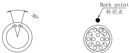
Socket front view 插座前视图