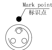
view K K向孔位排列