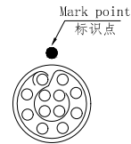
view K K孔孔位排列