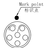
view K K向孔位排列

DRAWN BY: 绘图: PD03 2024.05.28 CHECKED BY: 审核: Z01 2024.05.28 APPROVED BY: 核准: PD05 2024.05.28